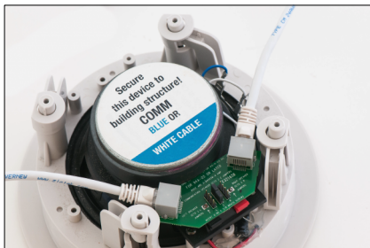
Typical connection of ethernet cables to speaker