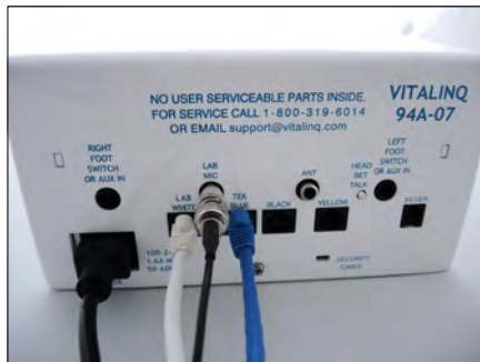
Connection of ethernet, coaxial and power cables to console